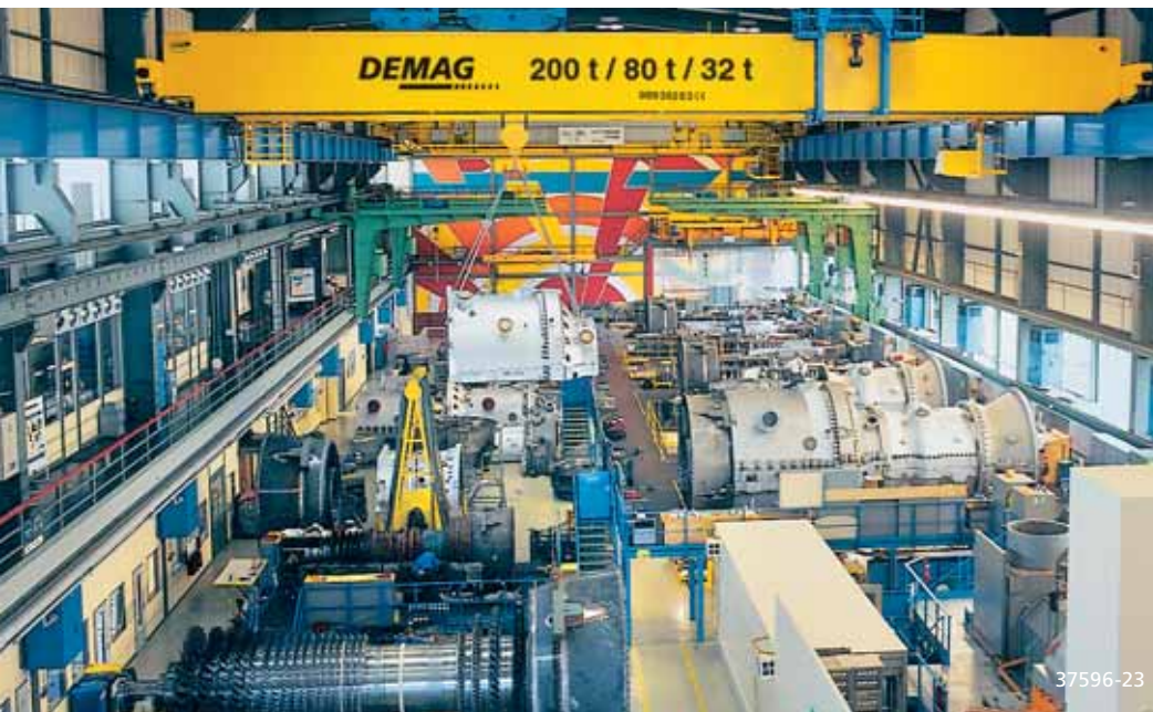
Demag process cranes are transporting workpieces weighing up to 200 mt with millimeter precision for the production of turbines and generators

Cranes equipped with automatic functions or performing fully automated processes optimize precision operations for the changeover and setup of tools and machines. Reliable load-sway controls and automatic positioning systems ensure that Demag process cranes provide for high handling rates and gentle handling.