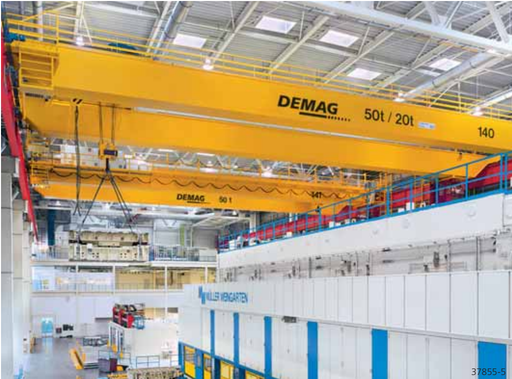
Demag Process Cranes changing tools in a stamping plant in the automotive industry

Fully automatic process cranes are optimized to meet the specific requirements of the given application. They communicate with integrated higher-level control systems, such as a warehouse management computer, for example. All motions, including the load pick-up and deposit sequences, are controlled by a computer program. Continuous supervision is not necessary; manual intervention is limited to an emergency stop or switchover to manual control.