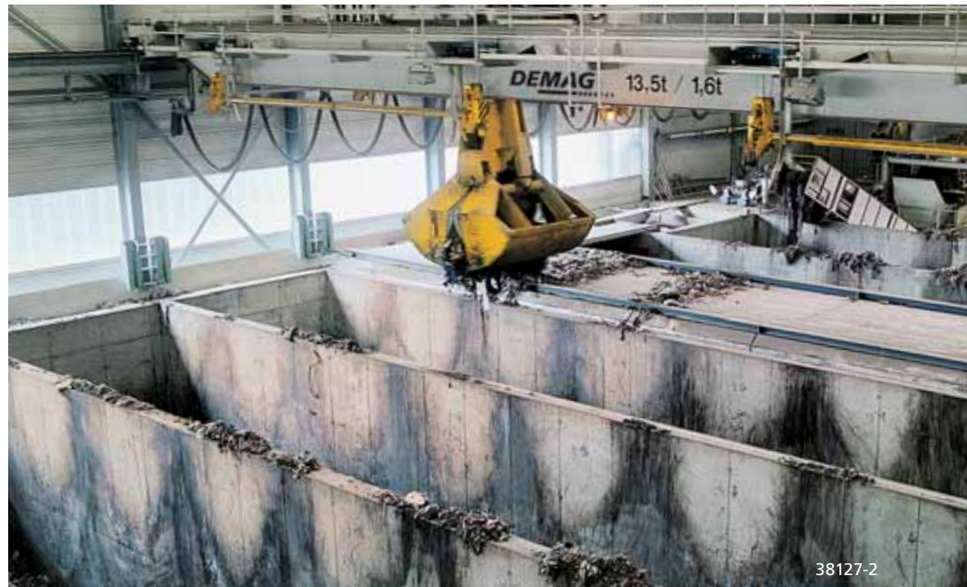
Demag Process Cranes used for fully automatic filling of composting boxes with organic waste in a waste disposal facility