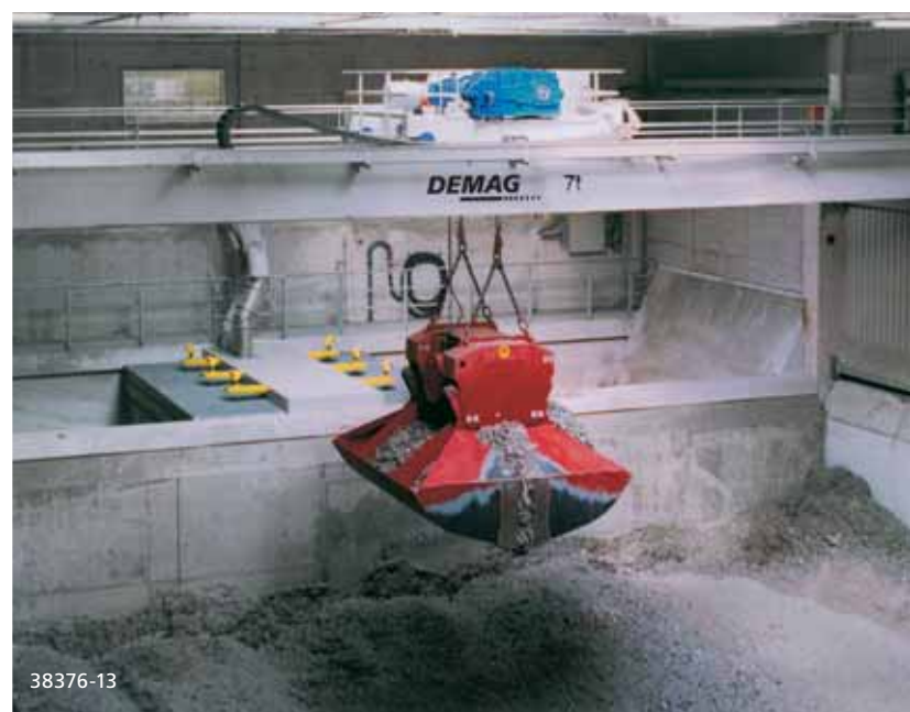
Demag automatic process cranes operating in a cement works