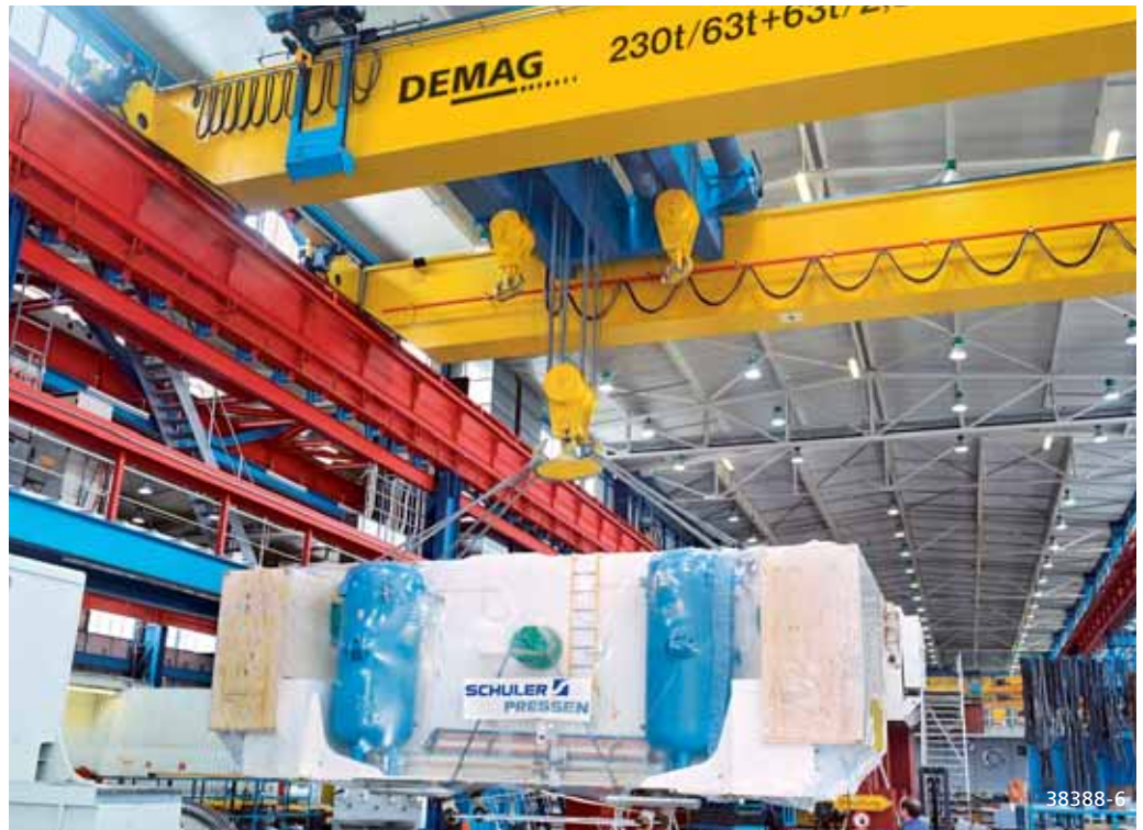
Demag cranes in operation in a stamping plant