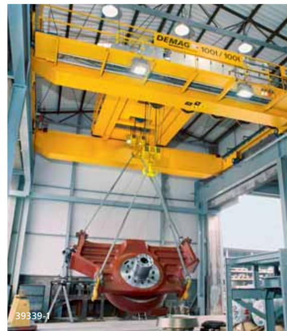
Cranes are used for turning components in the production of crusher parts