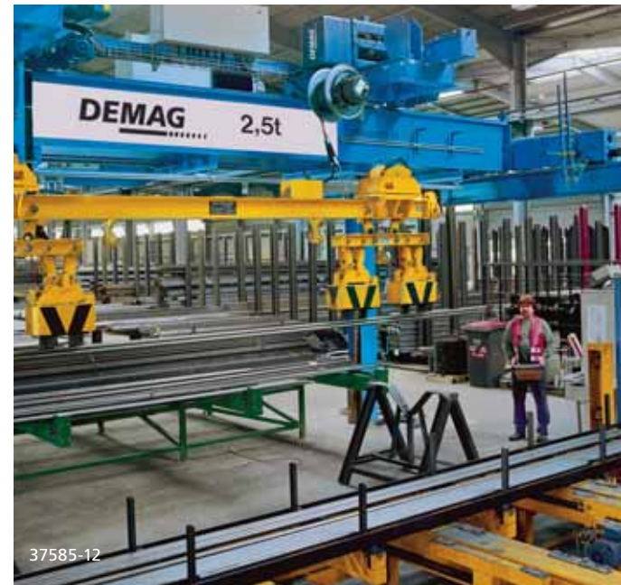
Demag Coilmaster in a fully automatic coil store with magnets or grabs as load handling attachments