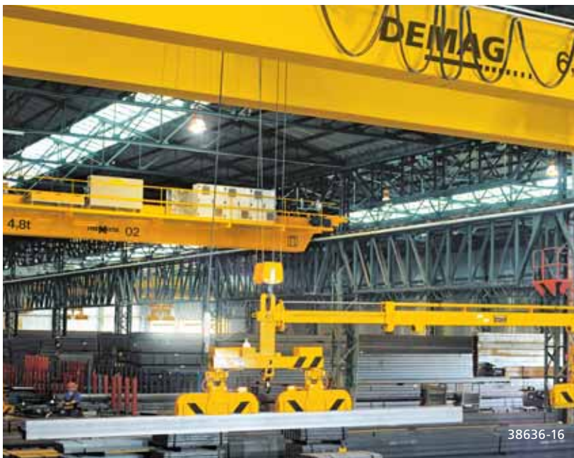
Demag Steelmaster with a magnet spreader for handling long materials, single items or metal plates

A major contribution is provided by crane concepts developed by Demag Cranes & Components that are tailored to meet the specific needs of individual processes, and to satisfy the industry requirements for clearly and reliably organized storage facilities with a high level of capacity utilization.