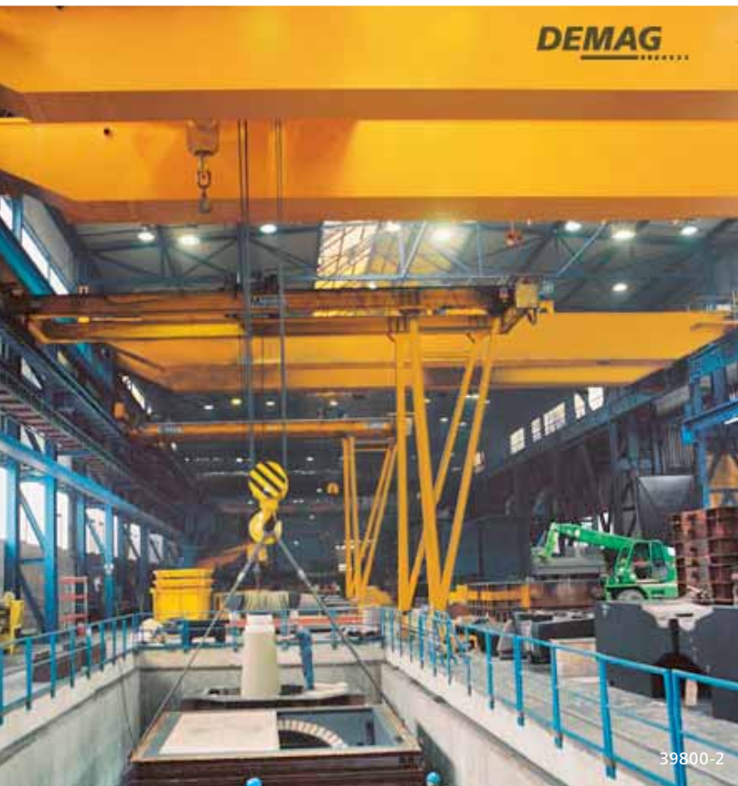
The casting ladle is precisely positioned and molten iron is safely and reliably transported to the casting machine in a foundry

maintained, the crane system can continue operation with the back-up systems to avoid any downtimes. Secondly, "intelligent controls" for versatile operating modes include integrated control mode and error management for the drive control system, bypass controls and the general systems. The third pillar comprises "crane visualization". This provides a clear representation of the complex systems and gives the operator an overview of the system status at all times.