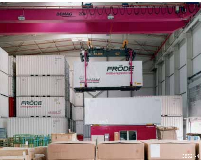
Optimum utilization of space thanks to warehouse management systems and intelligent Demag process cranes

Whether the crane is controlled manually by radio remote control or by a warehouse management system, all Demag crane variants offer the benefits of optimum space utilization and simultaneously rapid access to the given furniture containers.