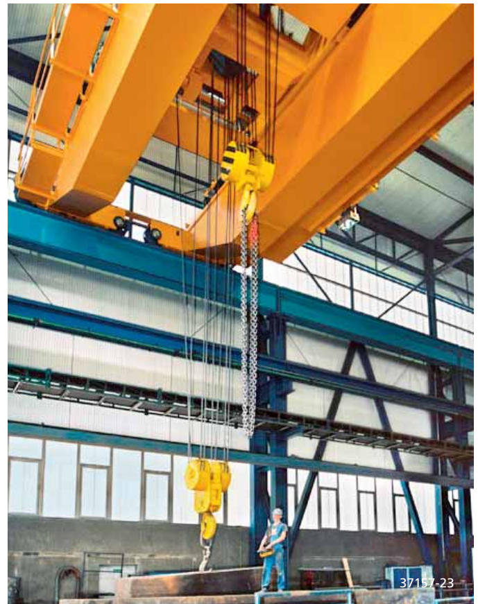
Demag cranes safely transport loads to the next step of the process in foundries