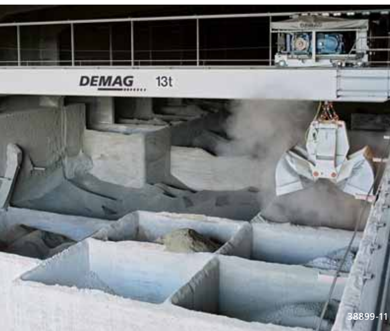
Fully automatic replenishment and retrieval of the various additives by a Demag automatic crane in a cement works

An automatic process crane carries out the often difficult positioning processes more quickly and usually more accurately than a human operator. For load sway motions that occur due to high acceleration and deceleration rates, anti-sway controls are used to prevent load sway by continuous detection of the load status parameters followed by appropriate adjustments.