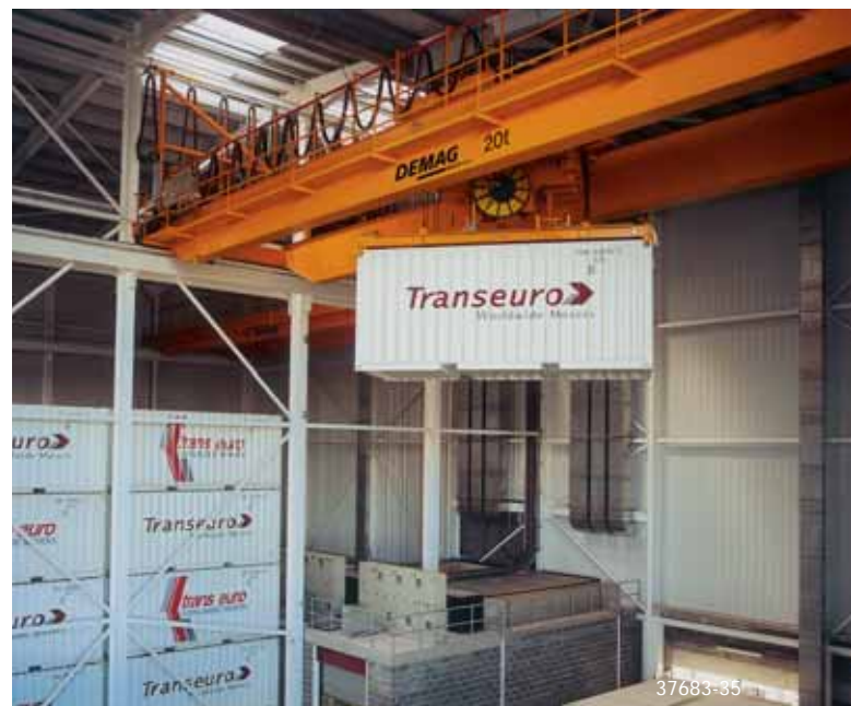
Automatic spreaders for 20 and 40-foot containers

Demag automatic process crane handling containers at a shipping company