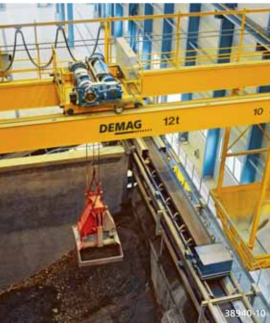
Demag Process Cranes in the refuse disposal industry

Demag refuse handling cranes are optimized for serving bunkers and pits. Using laser assisted vertical positioning controls they are able to perform all processes fully automated. This eliminates wasted cycle time for unnecessary movements and positioning in favor of optimum throughput performance.