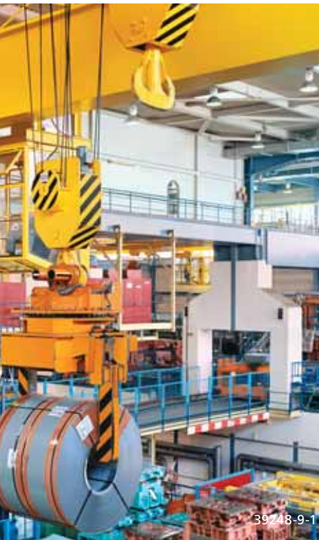
Demag hoist units provide for ergonomically optimum workplace design.

In assembly operations, hoist units help to provide ergonomically favorable and efficient workplaces for the workers.