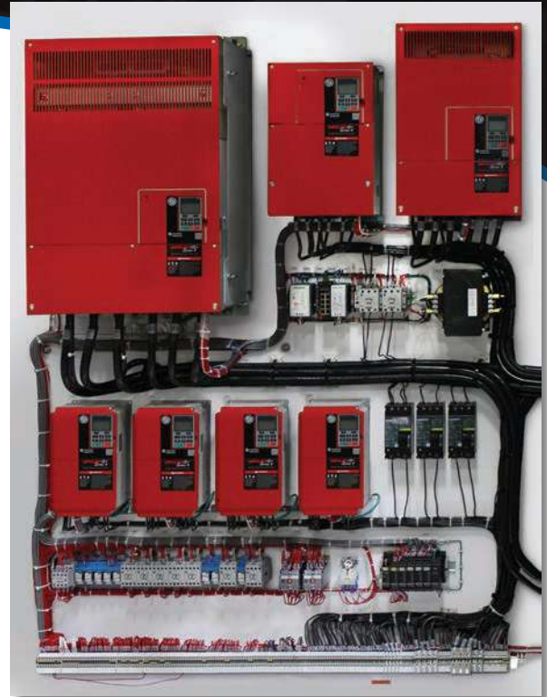
Engineered AC Panel

For more information, contact Magnetek Material Handling or your local Magnetek Sales Representative.