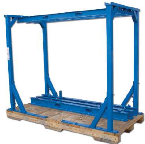
Assembled Festoon Shipping Stand