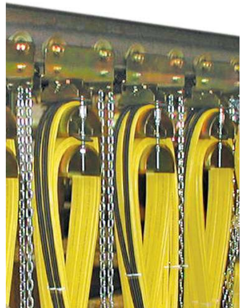
Heavy-Duty I-Beam Festoon

For more information contact Magnetek Material Handling or your local Magnetek Sales Representative.