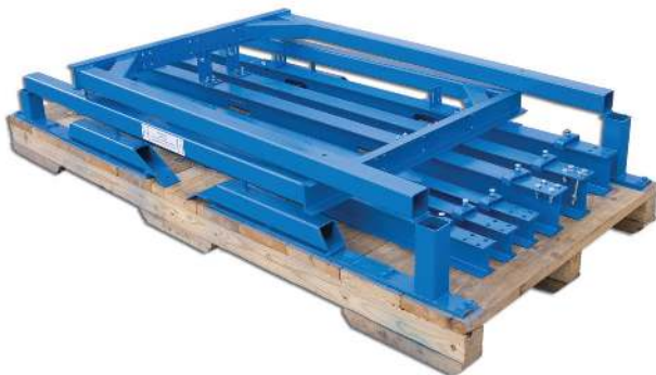
Disassembled Festoon Shipping Stand

Now you can eliminate the expense of custom fabricated festoon shipping stands when ordering assembled festoon systems. We now offer our customers a returnable festoon shipping stand that significantly reduces system costs. Our festoon shipping stands have been designed in a standard size that's adjustable to accommodate up to three 10-foot I-Beams so customers can hang systems with longer storage lengths and more trolleys. Plus, our stands have been designed to be collapsible to minimize the return freight cost for our customers.