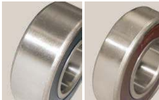
Heavy Duty Standard